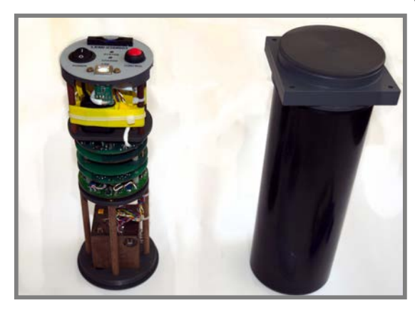
Figure 1: LEMI-026 system with and without housing cover.

It may be used for autonomous measurements with moving carriers (drones) or being included in sea/land stations. There are two-components tilt-meter and GPS antenna inside allowing obtaining precise measurement timing, magnetometer coordinates, altitude and attitude during movement. These data are stored in the SD memory card.