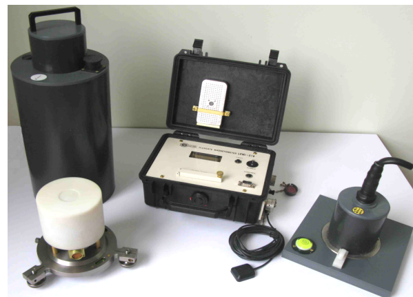
Figure 1: LEMI-018 system with various sensors magnetometer.

KJT Enterprises Inc. 11999 Katy Freeway, Suite 200 Houston, TX, 77079 USA Tel: +713.532.8144 Fax: +832.204.8418 Email: info@KMSTechnologies.com www.KMSTechnologies.com